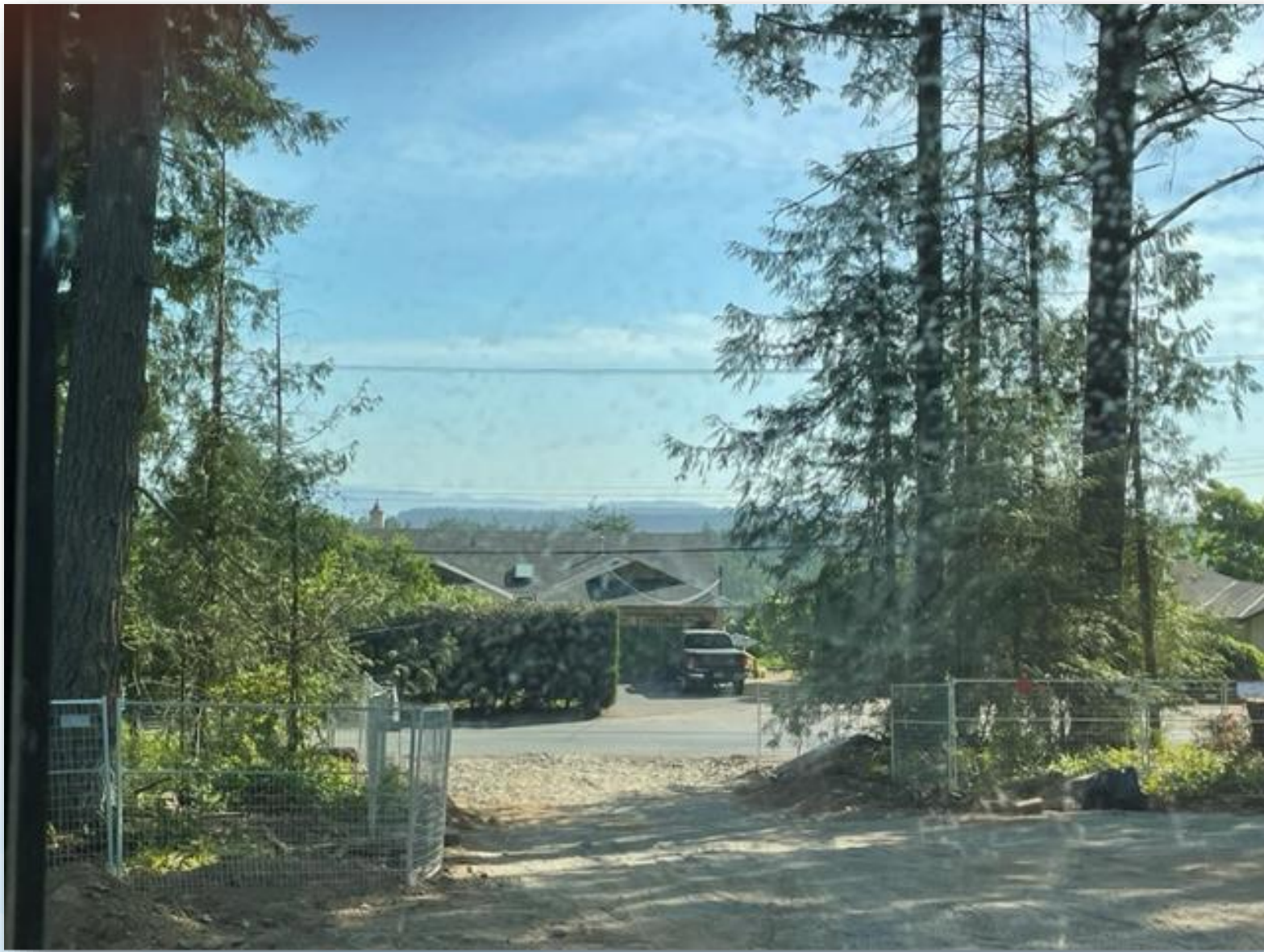
SEŠIŠEJ Childcare Centre