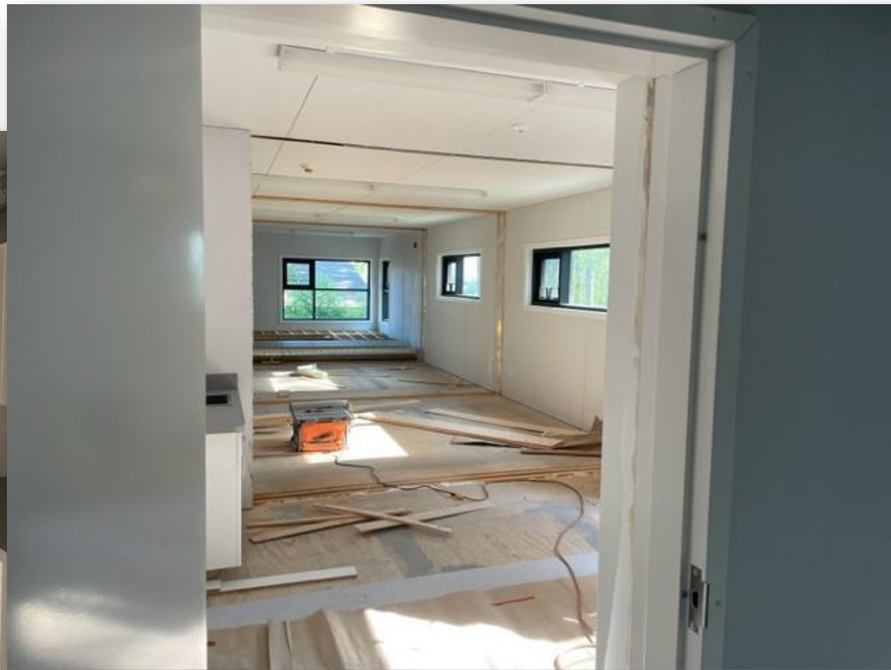
SEŠÍŠEJ Childcare Centre