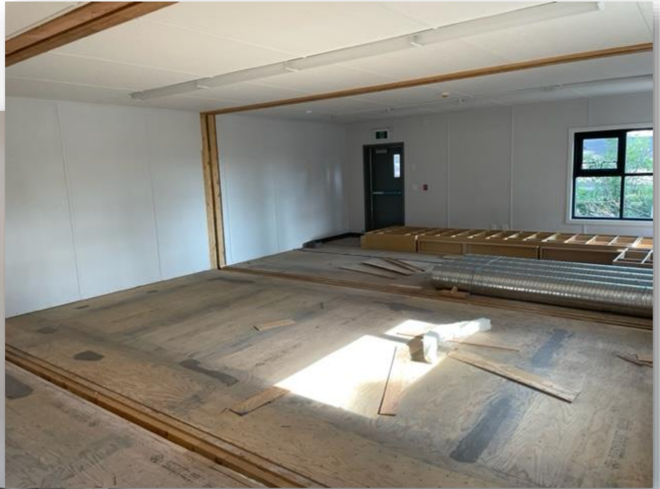
SEŠIŠEJ Childcare Centre