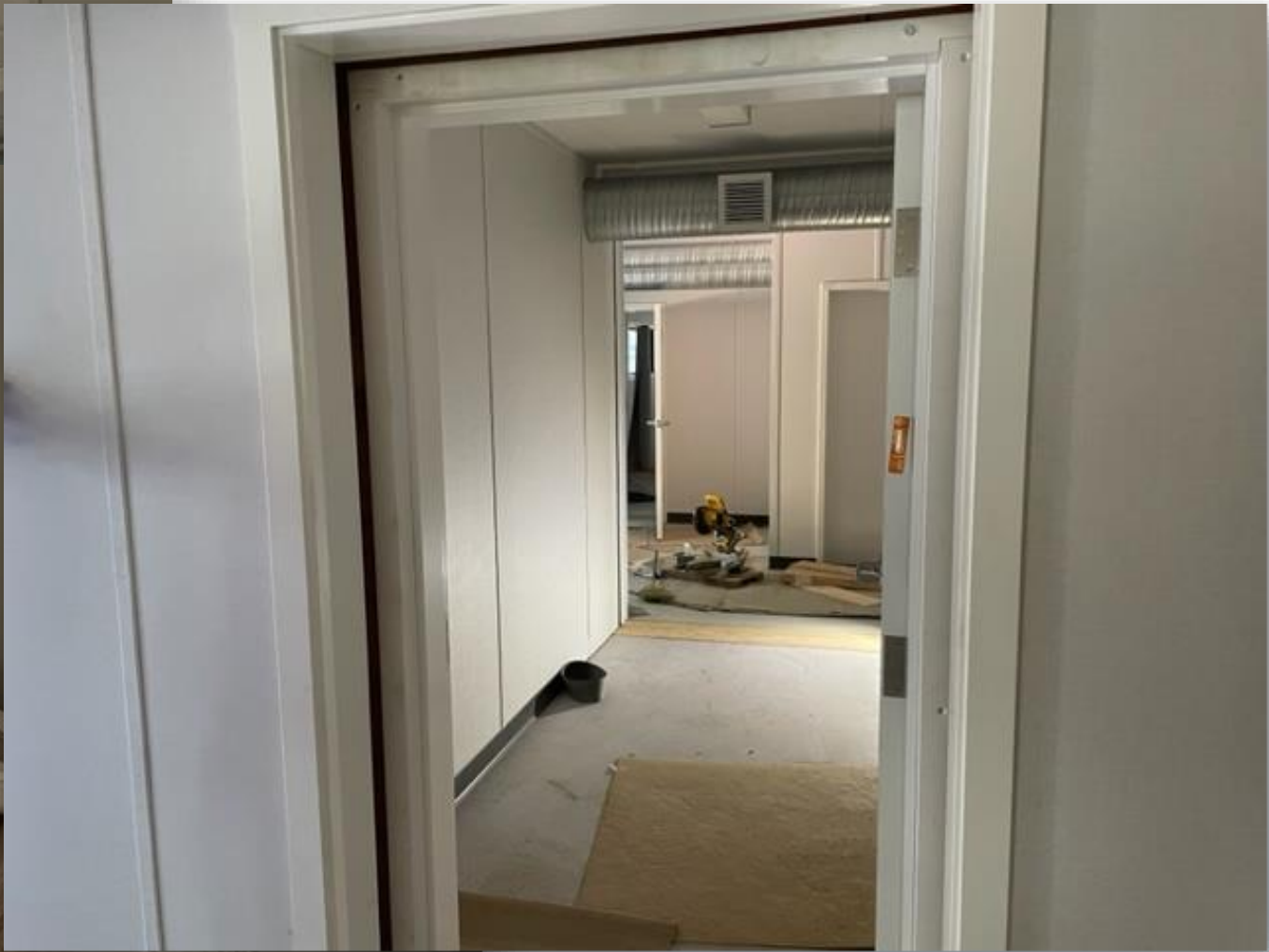
SEŠÍŠEJ Childcare Centre